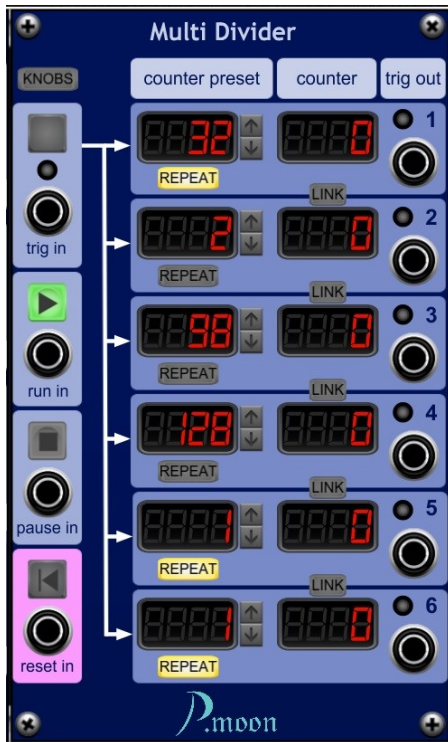
c) Frequency divider and event counter